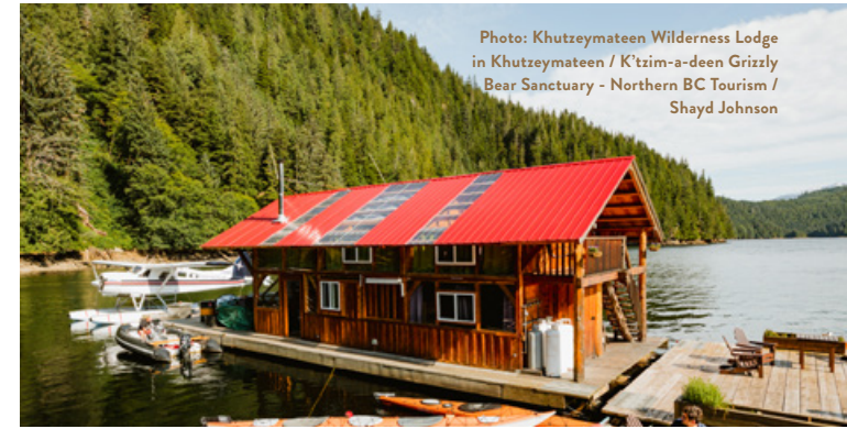
Photo: Khutzeymateen Wilderness Lodge in Khutzeymateen / K'tzim-a-deen Grizzly Bear Sanctuary - Northern BC Tourism / Shayd Johnson

☎ 250-627-1446 ✉ prracquet@gmail.com 📄 www.facebook.com/PRRacquetCentre