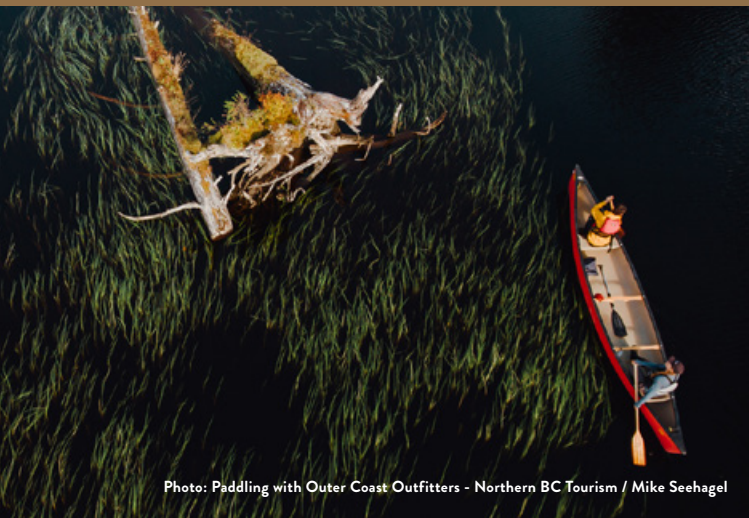
Photo: Paddling with Outer Coast Outfitters - Northern BC Tourism / Mike Seehagel