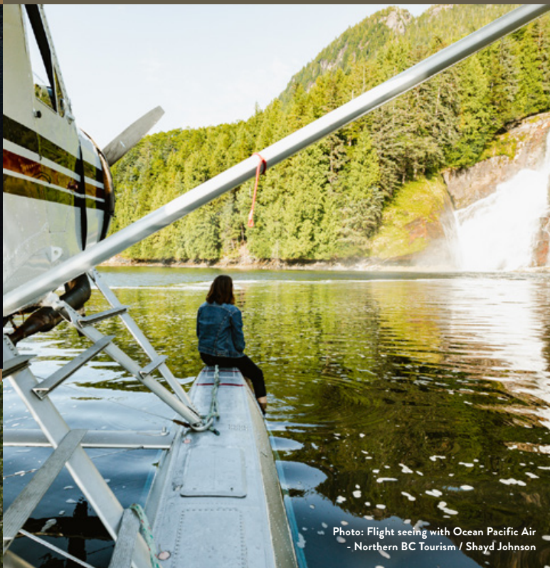
Photo: Flight seeing with Ocean Pacific Air - Northern BC Tourism / Shayd Johnson