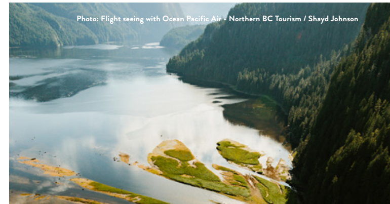
Photo: Flight seeing with Ocean Pacific Air - Northern BC Tourism / Shayd Johnson