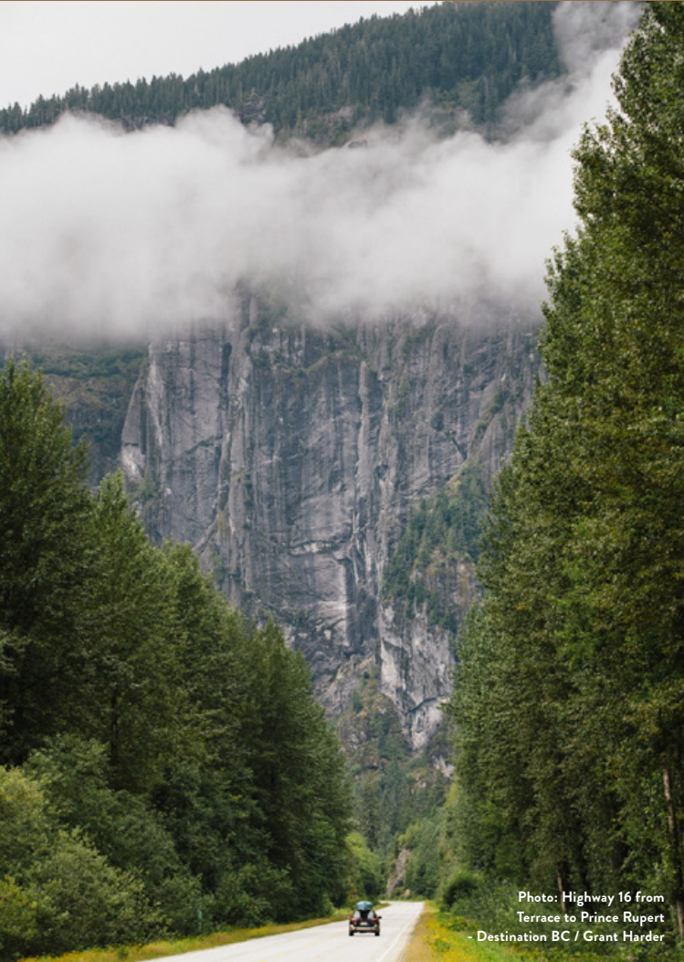
Photo: Highway 16 from Terrace to Prince Rupert